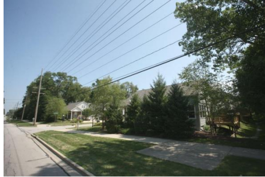
Exhibit C – Transit Campus Snow Removal Area