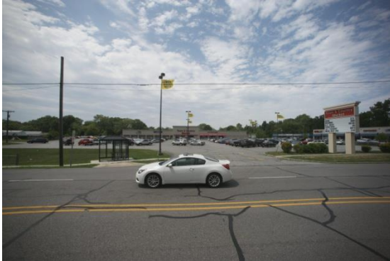
Exhibit B - Photos.